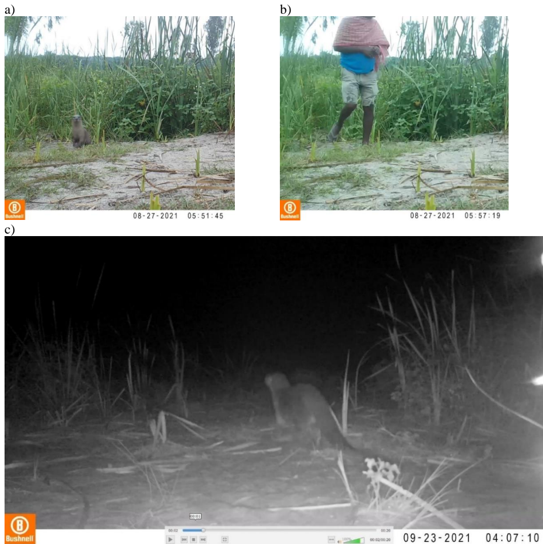
Figure 2. Smooth-coated otter photographs from video recorded in camera trap a) otter photo in the morning, b) local farmer caught in camera within 6 minutes of otter movement, and c) otter record in same location next month.