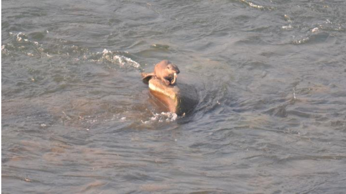
Figure 2. Picture of the Smooth-coated otter in Manas