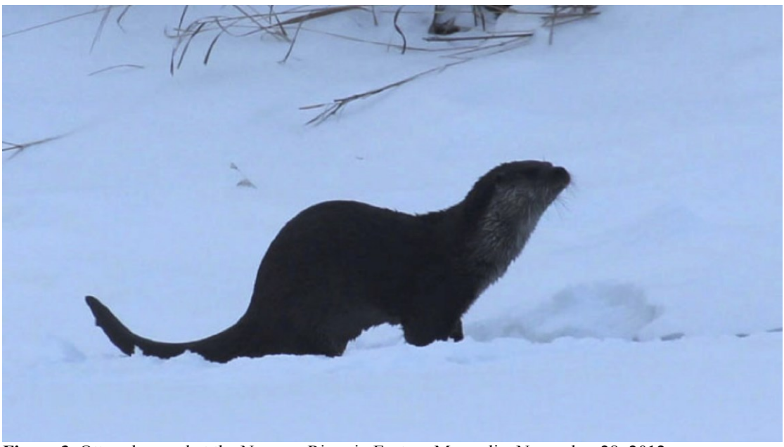
Figure 3. Otter observed at the Numrug River in Eastern Mongolia, November 28, 2012