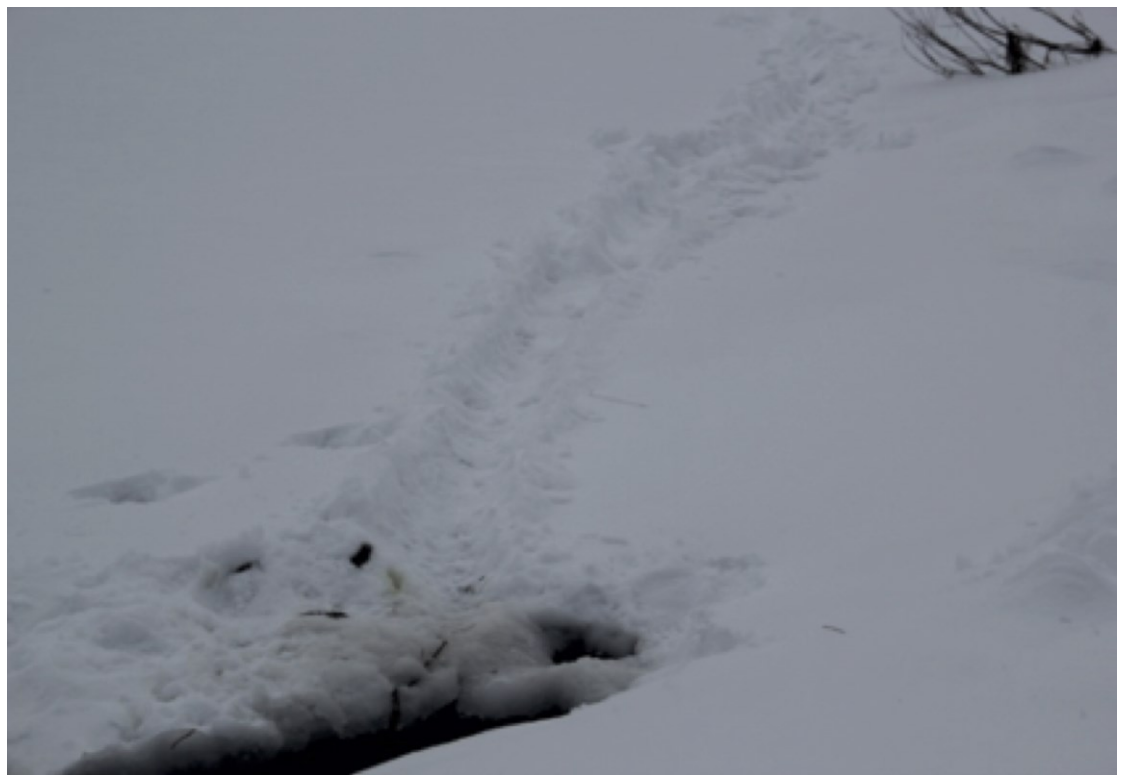
Figure 2. Otter tracks between two ice holes, Numrug River, November 29, 2012.