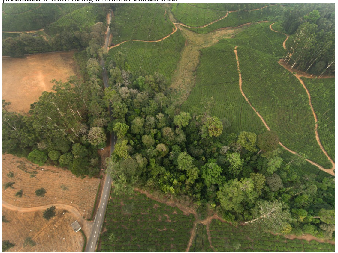
Figure 3 . An aerial shot of the fragment (Selaliparai 1) surrounded by tea estates and eucalyptus plantation, close to the spot of the road-kill on the Valparai plateau, Western Ghats.

gradually tapering tail clearly ruled out the small-clawed otter. The shape of the head (pronounced muzzle, characteristic of Eurasian otter) and the smaller body size precluded it from being a smooth-coated otter.