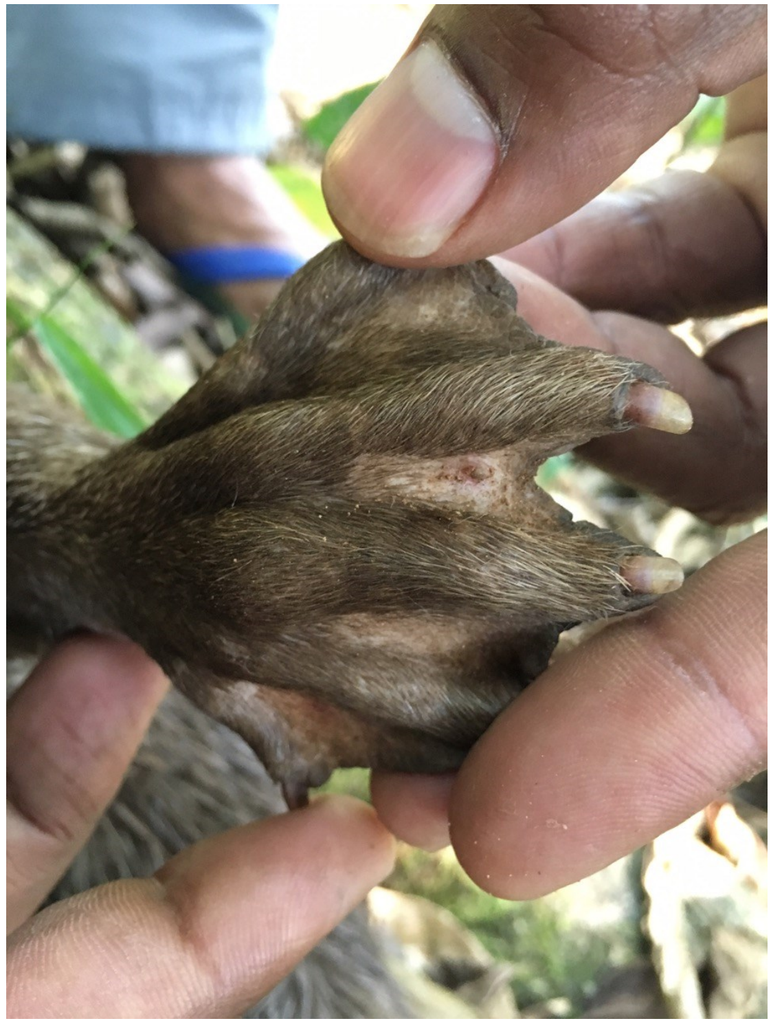
Figure 6. The claws and webbing of the road kill Eurasian otter found in Anamalai hills, India.