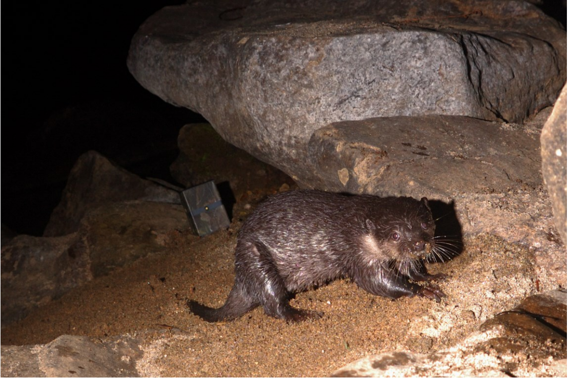
Figure 1 . Asian small-clawed otter photographed by a camera-trap set along a stream in Valparai, Western Ghats in 2010.

In the Valparai plateau in the Anamalai hills, Tamil Nadu, otters have been sighted occasionally. Direct sightings are few and it is difficult to identify otters in field from brief sightings. There have been concerns of local extinctions of otter populations due to illegal poaching (Meena, 2002). A study carried out in the Anamalai hills between 2010 and 2011 reported most of the streams to have otter presence (Prakash et al., 2012), and a few targeted camera-trapping surveys resulted in photo-trapping only small-clawed otter (Fig. 1).