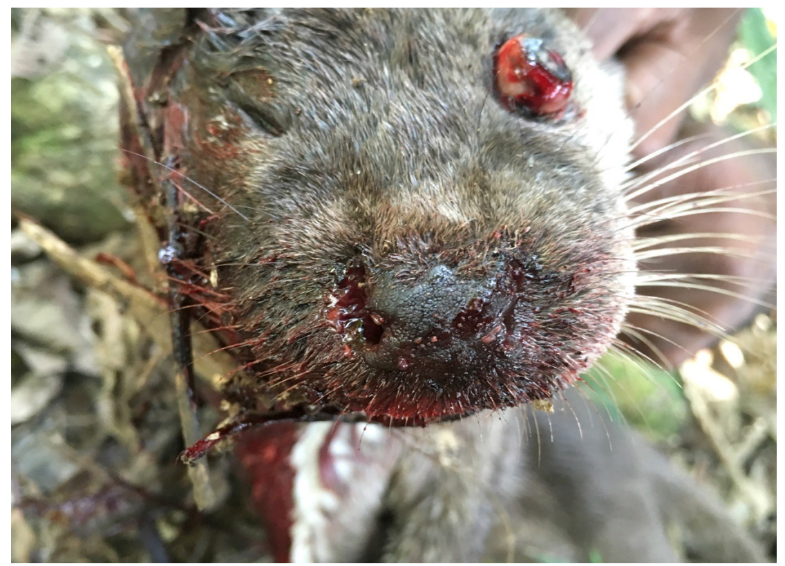
Figure 7. The zig-zag pattern of the rhinarium on the posterior edge.

Genetic analysis: A fresh sample (about a cm of the tail tip) was collected using sterile surgical blade and stored in ethanol. This was sent to the Laboratory for Conservation of Endangered Species (LaCONES) at the Centre for Cellular and Molecular Biology (CCMB), Hyderabad, and analysed immediately. Mitochondrial DNA is commonly used to identify sample tissues to species level (Vergara et al., 2014; Effenberger and Suchentrunk, 1999; Fernandes et al., 2008). DNA was extracted and a universal vertebrate mitochondrial cytochrome b marker (Verma and Singh, 2003) was used to identify species. Sequencing was done in triplicates in both the forward and reverse directions using ABI 3730xl. 329 bases of the cytochrome b sequence were generated from the otter sample (GenBank accession no. MF135247). This sequence showed 100-97% identity (100% coverage) with Lutra lutra (Eurasian otter) sequences already available in the GenBank database. The second and third closest matches were also members of Genus Lutra (Lutra nippon: 97% identity and Lutra sumatrana: 92% identity). Meanwhile, Lutrogale perspicillata showed 91-90% identity and Aonyx cinereus showed 89% identity to the sample sequence. Furthermore, a neighbour-joining tree, reconstructed using MEGA v5.05 with the above sequences showed that the sample was nested within the Lutra lutra clade (Fig. 8), confirming that the sample belonged to Eurasian otter.