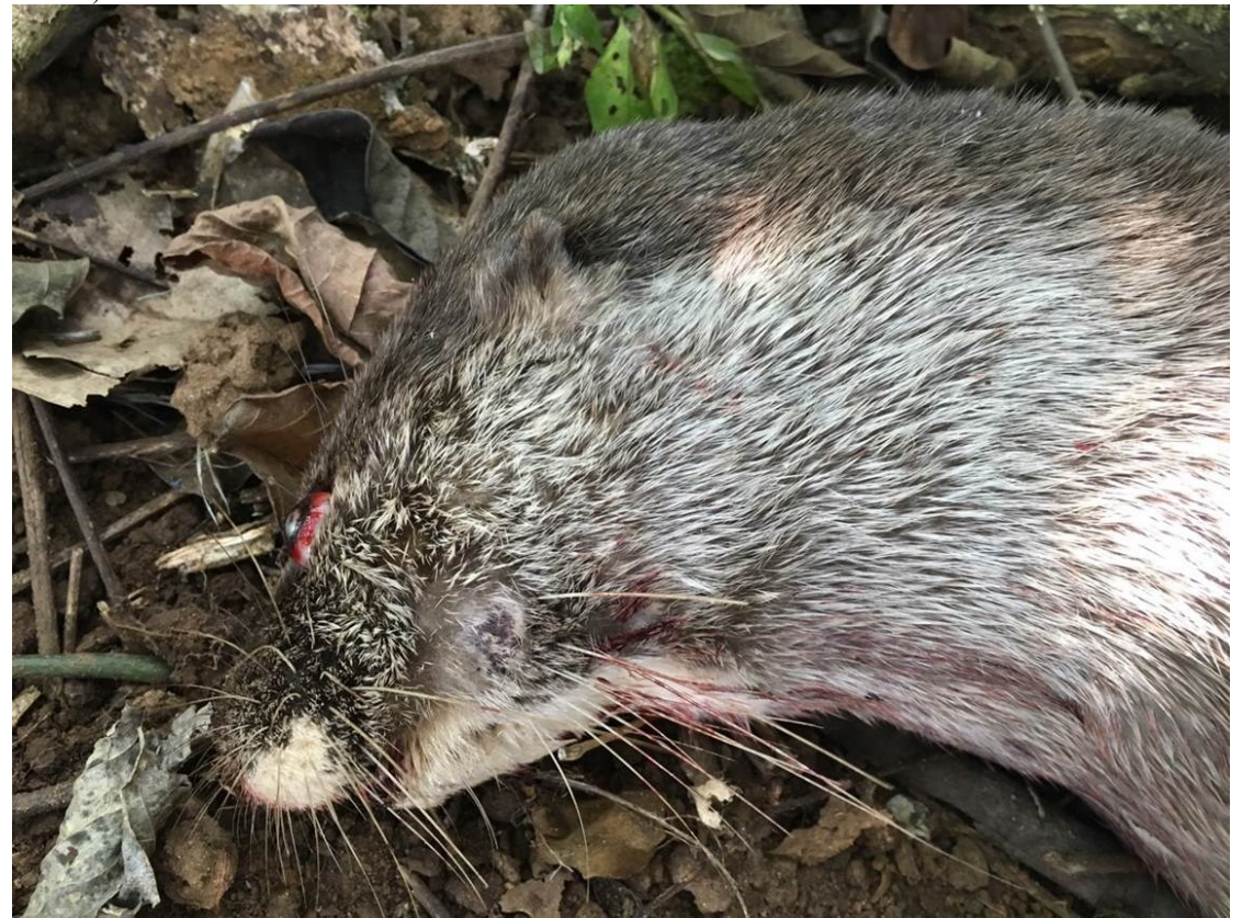
Figure 4. Head and neck of the road kill Eurasian otter found in Anamalai hills, India.