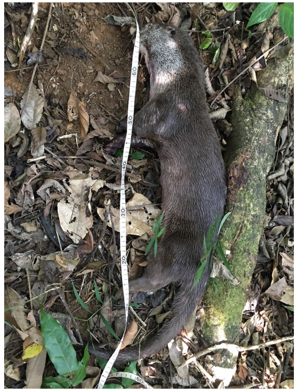
Figure 5 . The whole body of the road kill Eurasian otter found in Anamalai hills, India (tape measure in centimetres). Note the cylindrical and gradually tapering tail.