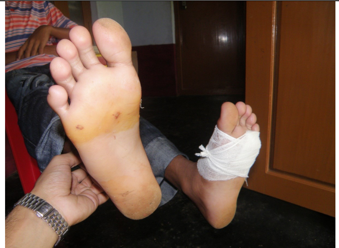
Figure 2. Smooth-coated otter attack on legs (Athirapilly Forest Range), Kerala