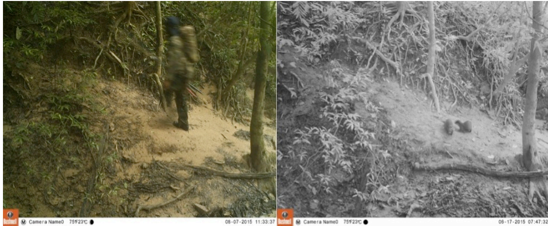
Figure 3. Evidence of poacher in same area as otter presence

effects of tourist visitation or simply reflects inherent differences between the streams cannot be determined. Given that the Sungai Relau had more tourism and less otters and the Ceruai had no tourism, more otters but also evidence of poachers, it could be possible that tourism reduces poaching activity so there is the possibility that while it might also reduce otter activity, its overall effect on otters in a situation of poaching cannot be predicted.