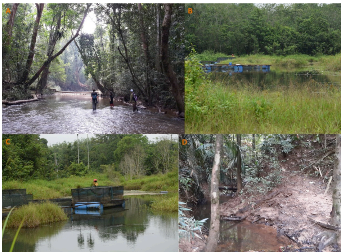
Figure 2. Habitat types of otters in and around Taman Negara

Wild Pig ( Sus scrofa ) accounts for 69% of the 4707 images recorded and 41% of notionally independent images and was the most frequently recorded animal. Areas with the highest wild pig activity had few or no otter records. More study needs to be conducted in order to check whether there is a correlation between wild pig activity and otter presence.