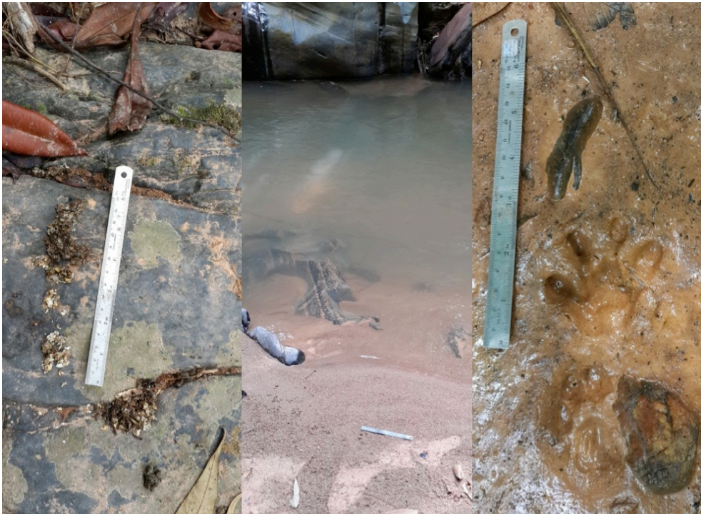
Figure 8. Otter Signs - On left is otter spraint, center is foot prints near waters edge, right is close up of foot print

The search for the Hairy-nosed Otter needs to be extended to other areas in the peninsular. A lack of knowledge about the different otter species that are present in the region, and their importance in their ecosystem, and how these animals are exploited in the pelt and pet trade amongst many other threats are some of the factors that need to be addressed. From my experience, this past one year, involving the community is a necessary and significant approach to otter conservation in the region. Talking to people, showing them images of otters and detailing the threats they face seems to have made a difference in attitudes towards the species, at least in the short-term.