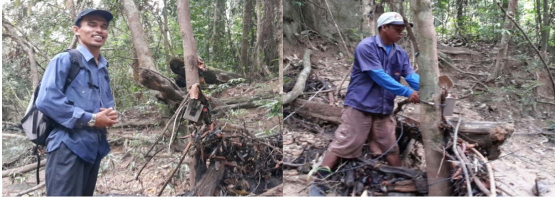
Figure 7. My guides - On left is a ranger provided by Taman Negara Parks and on right is my Bateq guide

communities. As iconic and flagship species, otters can be used to draw attention to larger issues such as water quality, habitat degradation, and chemical pollution from pesticide runoff, mining and tourism exploitation and other anthropogenic activities that will have an impact on the river ecosystem. Otter conservation will increase awareness, regulating the fishing and tourism activities, reducing habitat fragmentation and will provide protection and result in a healthy wetland habitat since otter presence indicates good water quality. I continue to advocate for these species in Malaysia and else where in Asia.