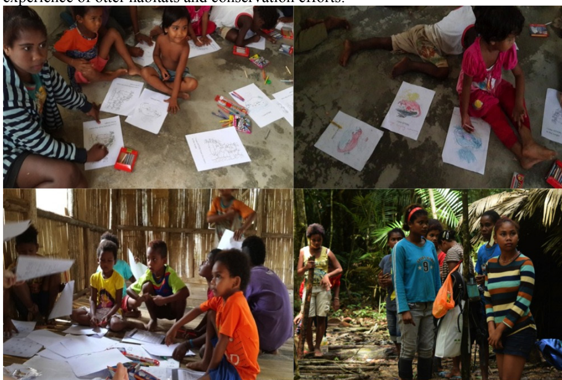
Figure 6. Outreach with Bateq children

I was able to give public lectures (via Monash University), increased my network via TRAFFIC South East Asia, spoke to people who walked the Tiger Trails through MYCat, presented at the Borneo Wildlife Festival, engaged with ECOTEER volunteers and their teams, engaged with foreign tourists that were visiting the National Park. I also use social networking as a tool to keep people interested and updated. I also took groups of people out of Kuala Lumpur on weekends to explore the Tin Mine lakes and to learn otter identification skills and give them a first hand experience of otter habitats and conservation efforts.