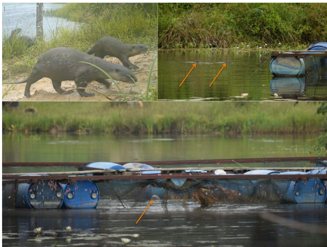
Figure 5. Otters at fish farms