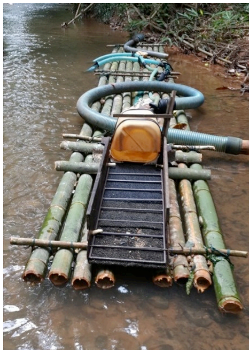
Figure 4. Illegal gold mining operations

Illegal gold mining (Fig. 4) is presently a looming threat to otter habitat in the area. Evidence of small operators was seen along parts of the river (Fig. 4), and aside from the disturbance of this activity there is opportunity for poaching alongside. A significant portion of the boundary of Taman Negara has been converted to Oil Palm plantation. This results in agricultural pollutant runoff entering local streams that then drain into the larger rivers. This is a potential threat to the prey species, resulting in reduction of prey biomass, but also a direct threat to the Small-clawed Otter especially if using organochlorides. More studies need to be conducted in this area to be more conclusive.