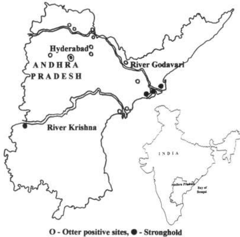
Figure 1: Study area Andhra Pradesh, India

of Coringa Wildlife Sanctuary; followed by Kolleru Lake in Krishna District and Mantralayam in Kurnool District (Fig. 1).